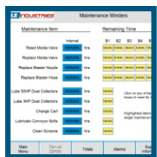
HMI / PLC Touchscreen