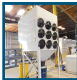
Cartridge Dust Collector