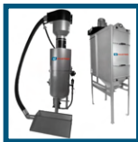
Media Reclaim System