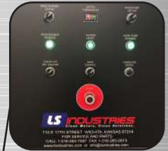
Easy to use controls.