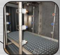
Nozzles designed to meet your needs.