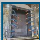
Parts Blow Off