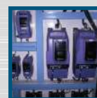
Variable Frequency Drives