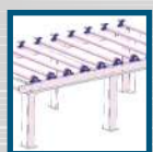
Extension Conveyor Transfer