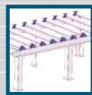
Extension Conveyor Transfer