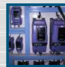
Variable Frequency Drives