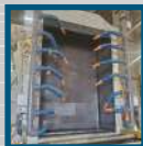
Parts Blow Off